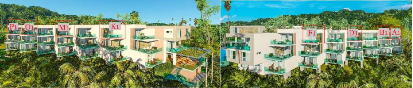
ALTEA one BEDROOM